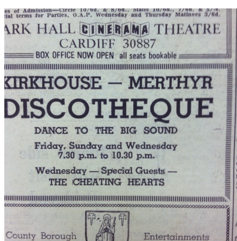
Discotheque Advert from the 1960s.