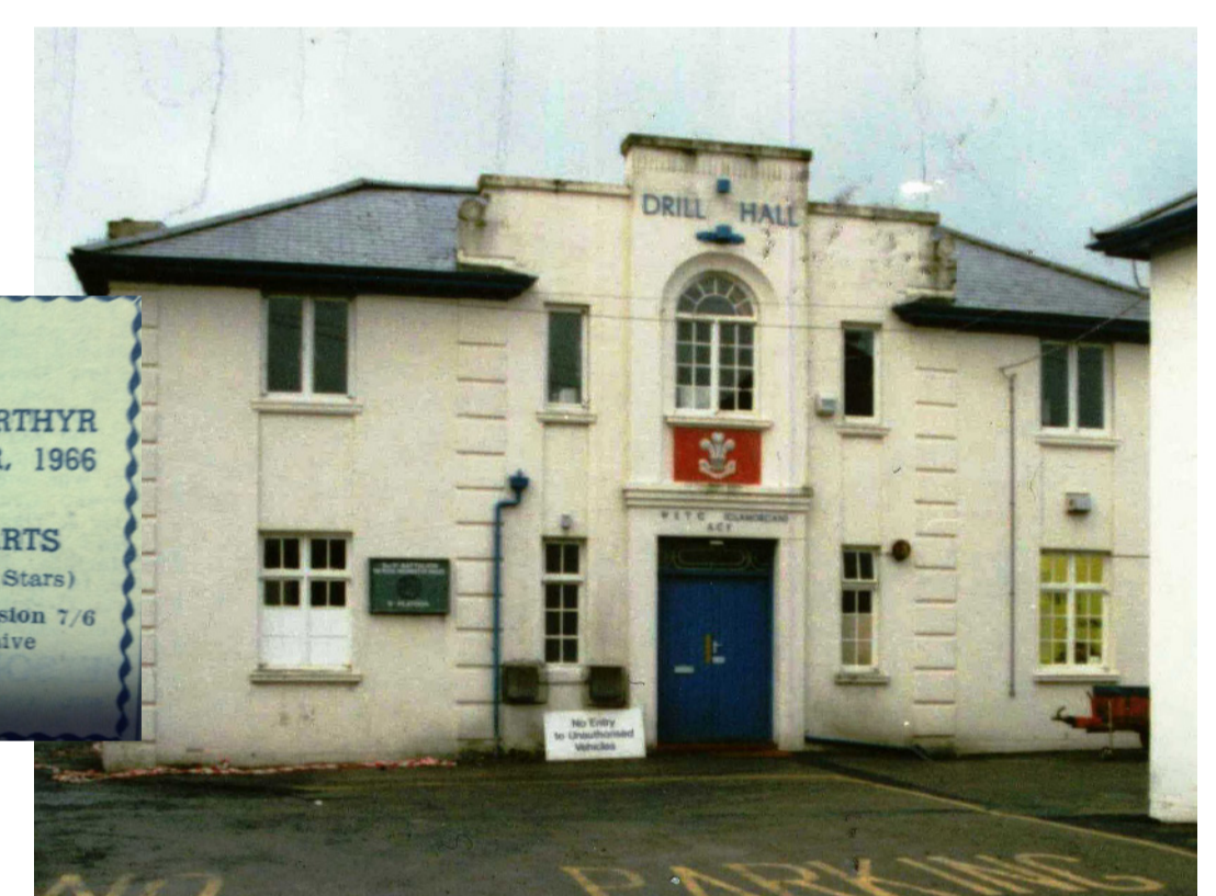
The New Drill Hall.