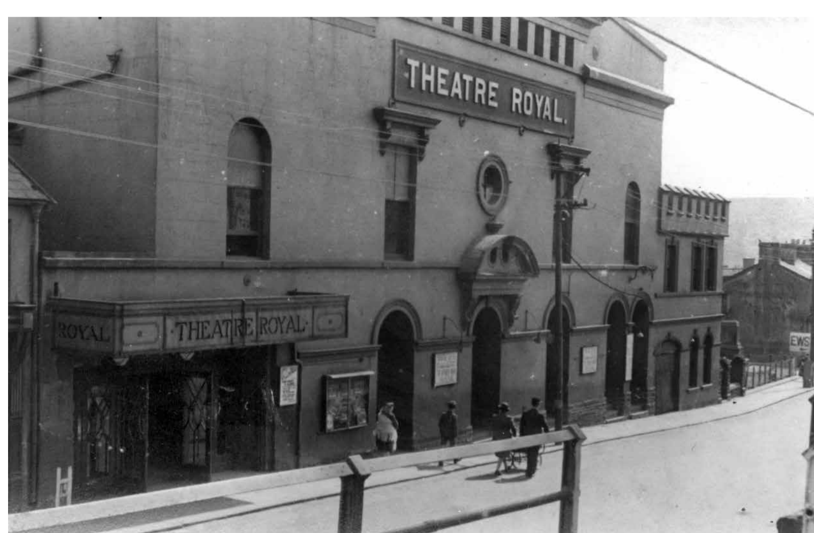
Two photos of the Theatre Royal.