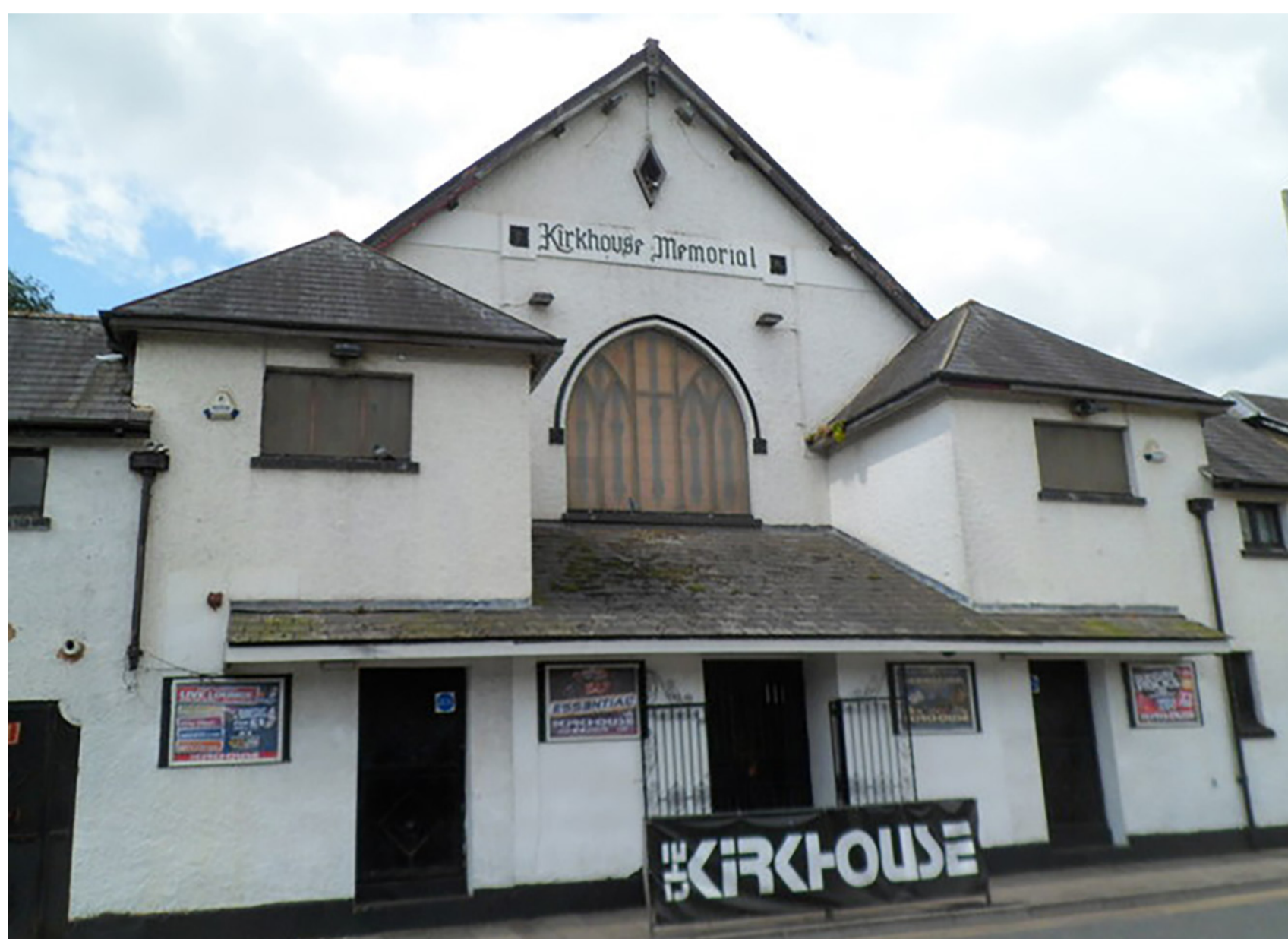
The Kirkhouse.

"It's the last place I saw The Bystanders with Vic Oakley on vocals."