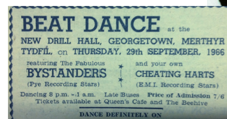
Advert from The Merthyr Express in 1966.